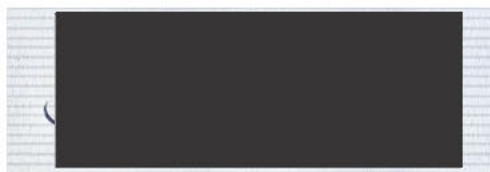
Global Issuance Services